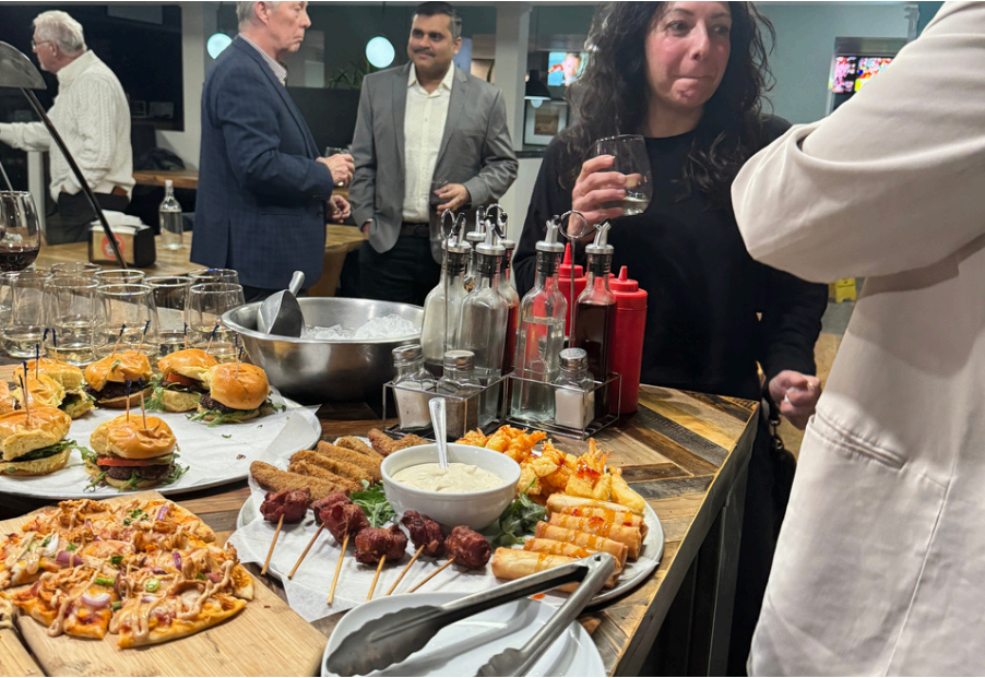
MONTHLY NETWORKING EVENTS